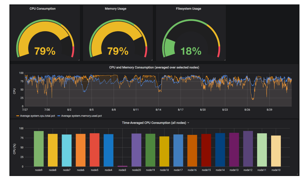
Fig. 1. Prometheus monitoring showing resource usage for one of the Kubernetes clusters

To keep the cluster secure, at UVic we configured Role Based Access Control to allow only those API actions which are suitable and necessary to run jobs on the cluster, and applied another PodSecurityPolicy to forbid privileged pods. To monitor the status and resource usage of the cluster, we use Prometheus [20], as shown in Figure 1.