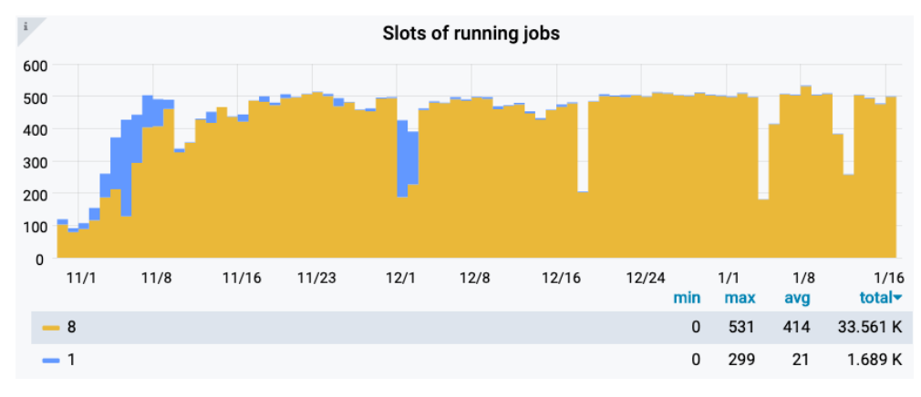
Fig. 5. Stable operations of the 500-core UVic production cluster CA-VICTORIA-K8S-T2. The abrupt brief dips in usage are due to scheduled downtimes for network maintenance external to the site